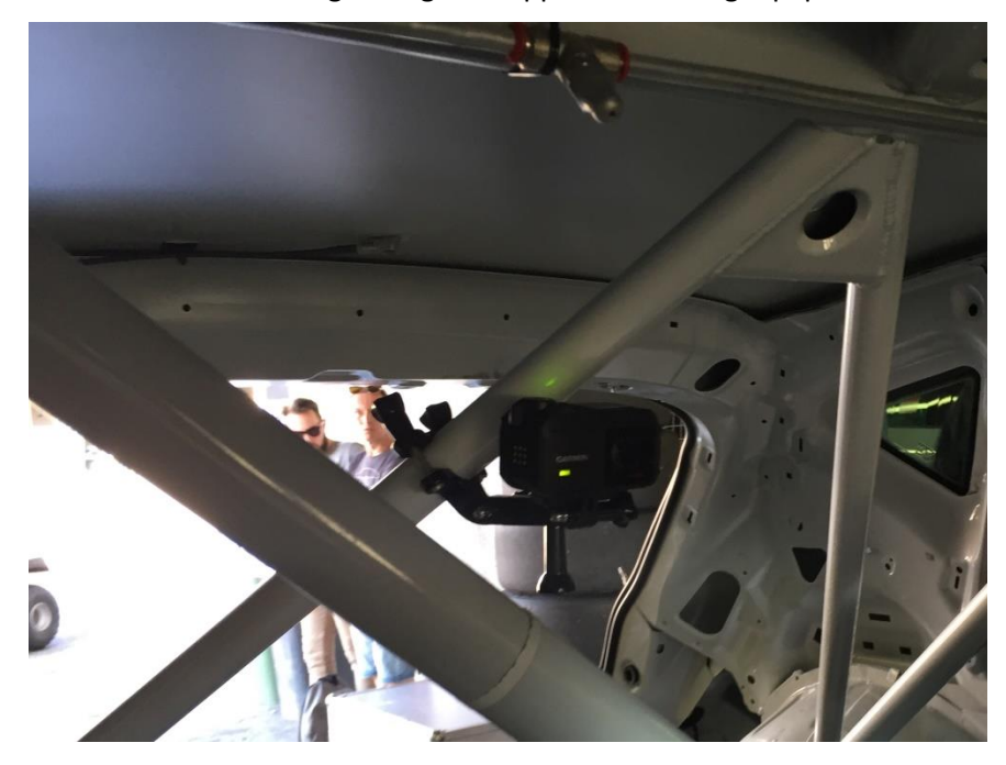
Field of view must be as per picture below:

Camera must be secure to the rollcage using the supplied mounting equipment.